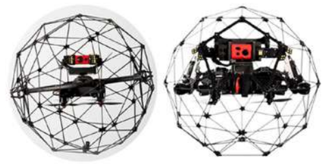
Elios 1 & Elios 2 launched in China